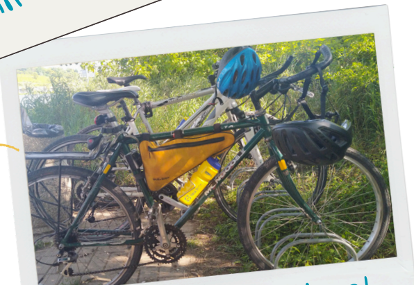
partner in crime!