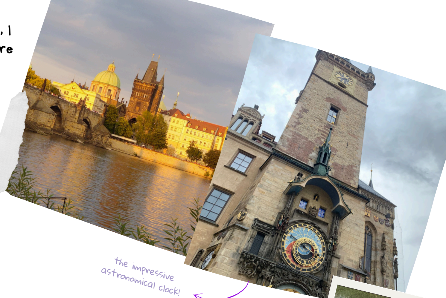
the impressive astronomical clock!

Prague is a city that feels like it's straight out of a storybook. I had the opportunity to wandering through its cobblestone streets, observing the stunning architecture—Prague Castle, the Charles Bridge, and the Old Town Square were just as impressive in person as they are in pictures.