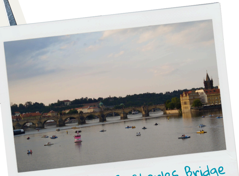
Vltava River & Charles Bridge

Prague is a city that feels like it's straight out of a storybook. I had the opportunity to wandering through its cobblestone streets, observing the stunning architecture—Prague Castle, the Charles Bridge, and the Old Town Square were just as impressive in person as they are in pictures.