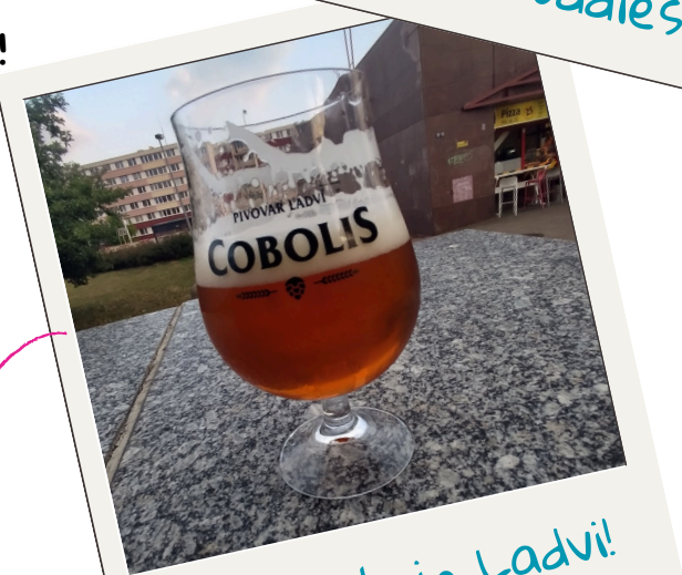
Best pub in Ladvil!